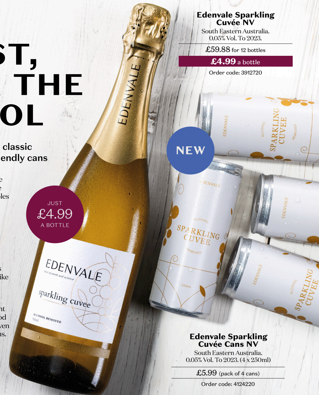
Edenvale Sparkling Cuvée NV

“The best non-alcohol fizz out there” (5-star customer review)