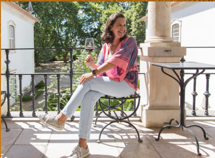
‘J-Lo’, the queen of Portuguese Black Reds

5-star customer favourites that pack maximum flavour into every glass – from just £7.99 a bottle