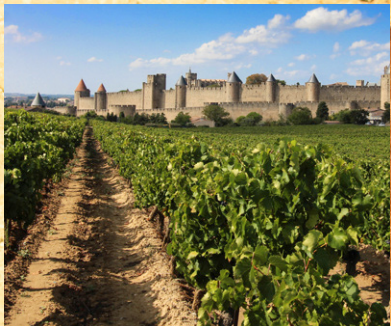
The walled city of Carcassonne, surrounded by vineyards