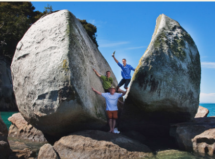
... and give you a cracking deal

★★★★★ “Stunning! Oh my, wonderful wine. Love it”