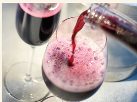
Full of Italian charm ... and lively bubbles

It's from a family of growers who've tended vines near the gourmet hub of Bologna for generations – but we discovered it being enjoyed off-menu by the local 'in' crowd, over Sunday brunch no less. Smitten, we raced to get it to you for summer!