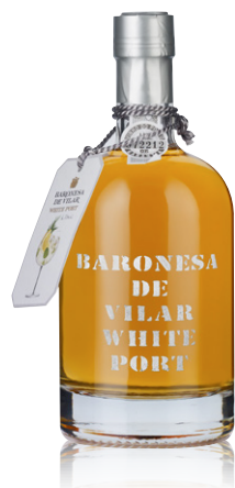
Baronesa de Vilar White Port NV Portugal. 19.5% Vol. To 2023. (50cl)

Good old Port has become ultra fashionable. And it's all thanks to delicious releases like this. Made by historic Barão de Vilar, this golden, beauty is fresh and at its best served nice and chilled in the sunshine. Welcome to the delights of white Port.