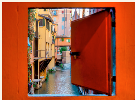
From a city of hidden gems

L'Occhiolino (Locky to its friends) is made for casual enjoyment so serve it in flutes, regular wine glasses ... or even tumblers. Just make sure it's nice and chilled, to bring those flavours and magical bubbles to life.