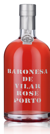
Baronesa de Vilar Rosé Port NV Portugal. 19.5% Vol. To 2024. (50cl)

£15.99 £12.99 a bottle Order code: 4094220