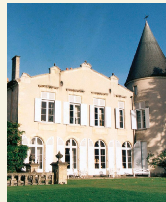
First Growth, Château Lafite