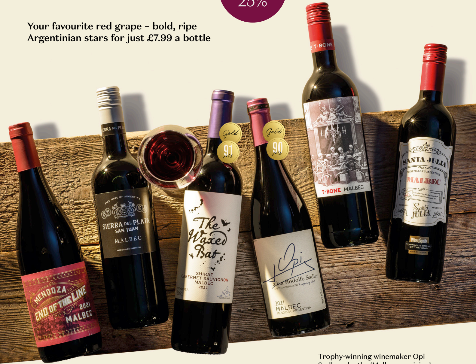
Trophy-winning winemaker Opi Sadler, aka the 'Malbec magician'

£131.88 £95.88 for 12 bottles SAVE £36 - £7.99 a bottle Order code: M15930 12-bottle case is 2 of each wine shown